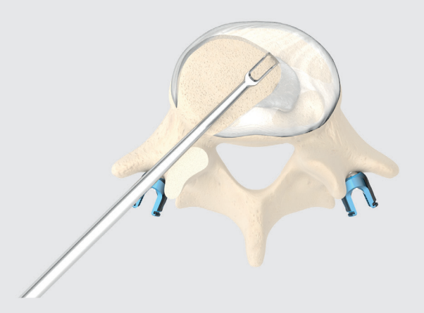
Fig. 2 Straight endplate scraper, 6 mm

NOTE: Careful preparation of the disc space, especially extensive roughening of the adjacent end plates, provides the basis for improved vascularisation and successful bone fusion. Damage of the bony base and cover plate can lead to sinking of the implant into the vertebral body.