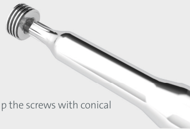
Fig. 1 Picking up the screws with conical distal end

A VERTICALE Counter Torque is available to prevent rotation when tightening the set screw. The torque can be comfortably mounted parallel or at right angles to the rod (Fig. 4).