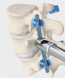
Fig. 3 Set screw starter with protection sleeve